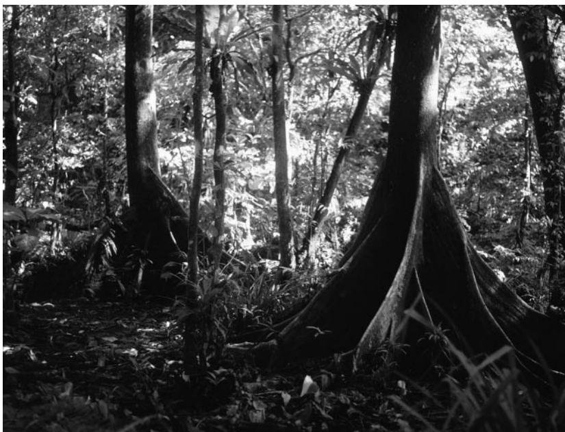
PLATE 1. Undisturbed freshwater swamp-forest in the lower catchment of the Yela River, Kosrae, Federated States of Micronesia. This frequently flooded forest type, dominated by the Micronesian endemic Terminalia carolinensis (buttressed roots), is found just landward of Kosrae's thick mangrove belt.

In response to these problems, Phillips and Gregg (2003) developed and recently introduced mixing model software (IsoSource) that is designed for situations in which n isotopes are being used and more than n + 1 sources are likely to be contributing to a mixture. IsoSource uses stable isotope data to calculate feasible ranges of source contributions by the following procedure. First, all possible combinations of source proportions that sum to 100% are calculated in user-specified increments (usually 1%). Second, the predicted isotope values of each mixture are computed using linear mixing model equations that preserve mass balance (Phillips 2001). Isotope values of computed mixtures are then compared with the observed isotope values; the range of combinations that match within a user-specified tolerance value (e.g., 0.1‰) is then described.